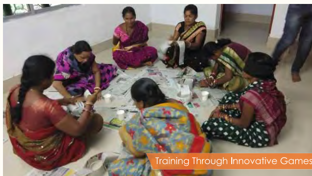
Training Through Innovative Games

Under OPGC's Sustainable Livelihoods Project, the Producer Company is being supported in various ways to build their expertise and become sustainable in the near future.