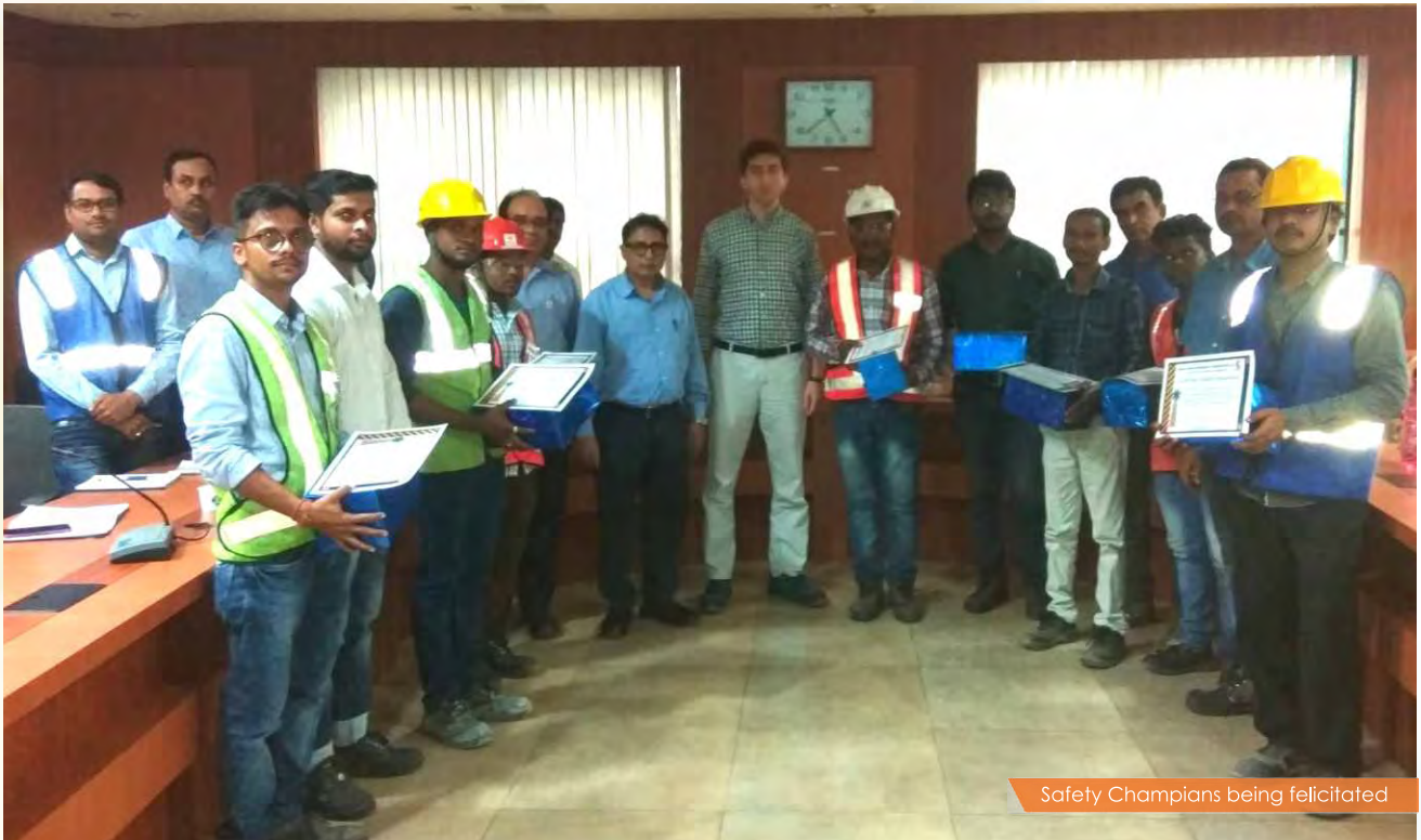
Safety Champions being felicitated