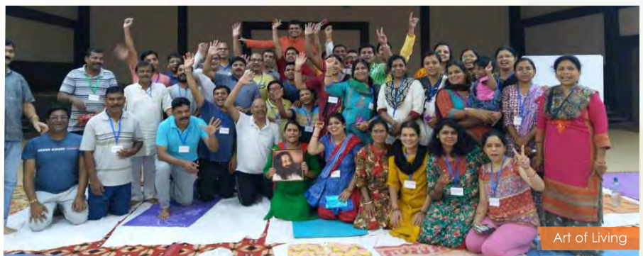
Art of Living