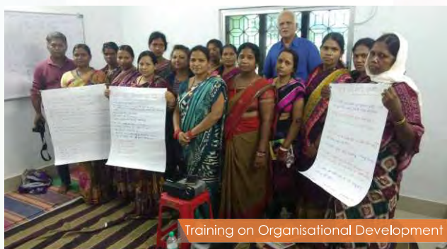
Training on Organisational Development

During the month, capacity building sessions were organized for the Directors, staff and members of Ib Srushti Producer Company on leadership building and poultry business management.