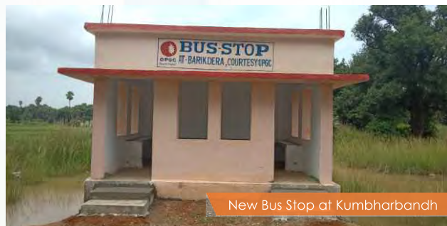
New Bus Stop at Kumbharbandh

Under CSR, OPGC has built a new stop near near Barikdera village of Kumbharbandh Gram Panchayat. The bus stop is adjoining the main road connecting Kumbharbandh with Dargaon, Tilia, Bandhabahal and nearby hamlets.