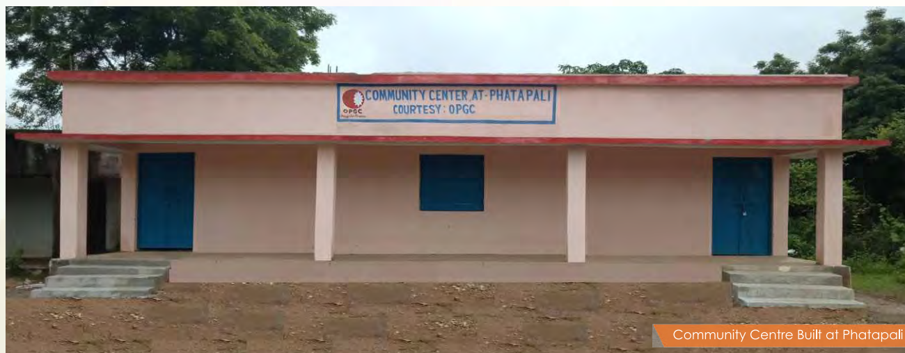
Community Centre Built at Phatapali

events, organize meetings and conduct many other activities that are aimed to add value to lives of common people.